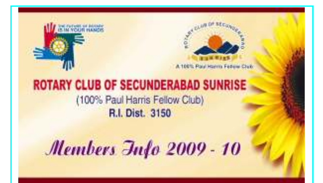
A Model of Title Cover of Members Information Booklet released at Installation Nite