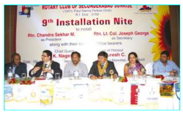
A view of the Dignitaries