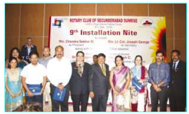
Newly inducted members with District Governor, Assistant Governor and President