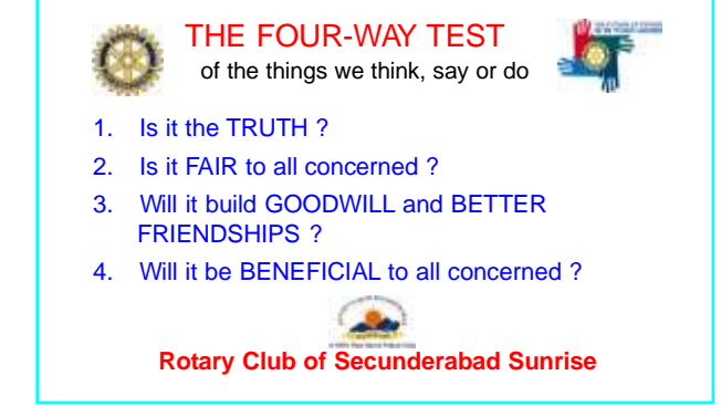
The Four Way Test which can be displayed on the table was distributed amongst the Rotarians for promotion