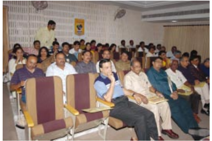
Members at the Seminar