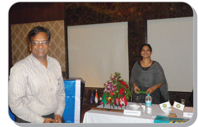
Speaker Meeting at Hotel Mercure on 1st Aug 2012 Topic - God Particle