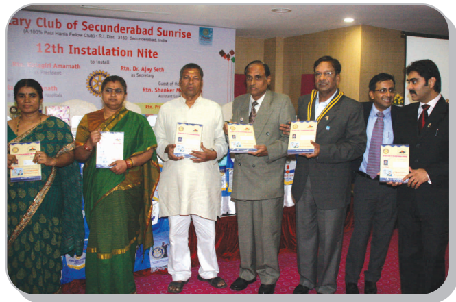
Distribution of Note Books on 12th Installation Nite