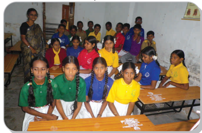
Benches Distribution at Centenary School, Sec'bad on 21st July