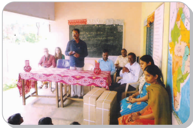
Distribution of Ceiling Fans at ZPHS Koyyala Gudem on 10th Sep 2012