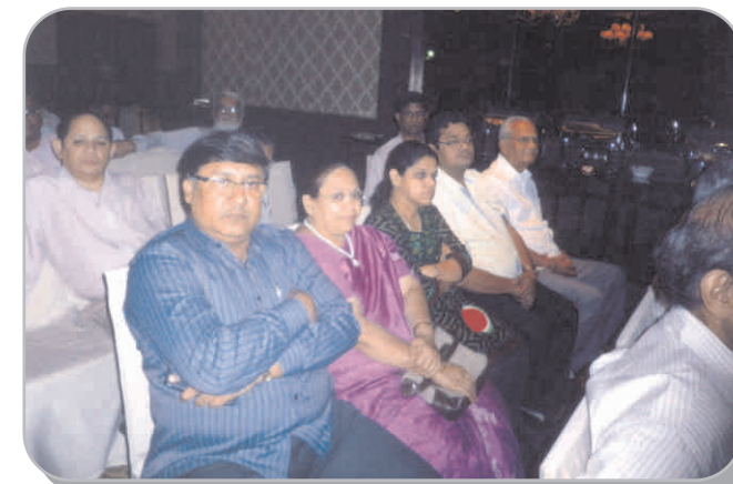
Speaker Meeting at Hotel Mercure on 1st Aug 2012 Topic - God Particle