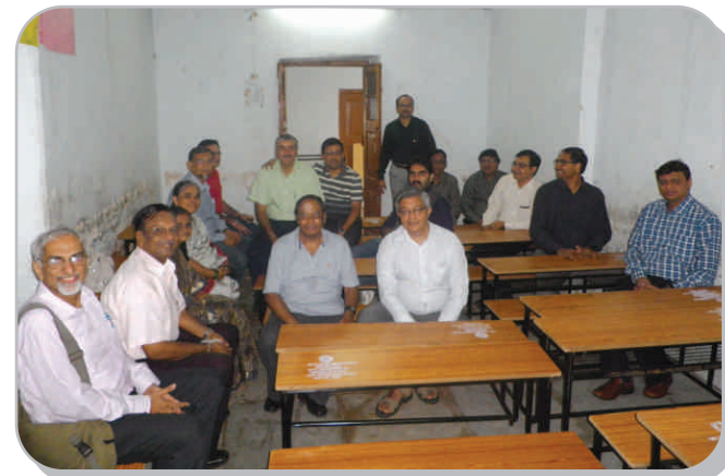
Benches Distribution at Centenary School, Sec'bad on 21st July