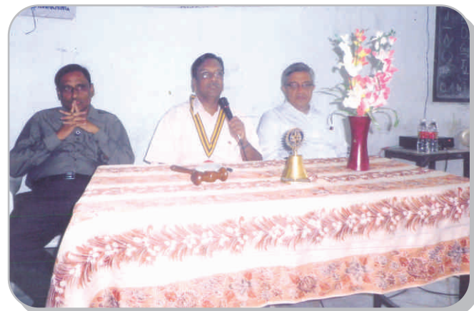
Meeting on 21st, July at Centenary School - Benches Distribution