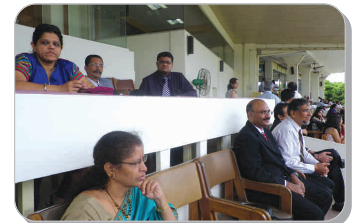
Members Enjoying Fellowship on 12th August 2012 at Hyd Race Club