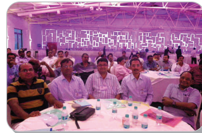
Members Enjoying at Seminar at N Convention Centre on 18th Aug 2012