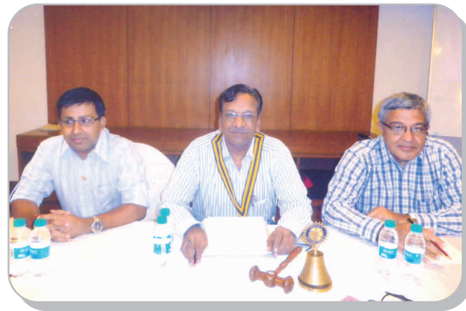
Meeting on 14th, July at Hotel Marriott