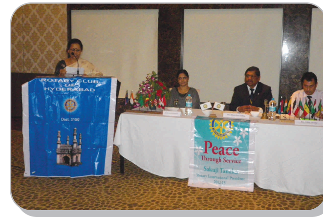
Speaker Meeting at Hotel Mercure on 1st Aug 2012 Topic - God Particle