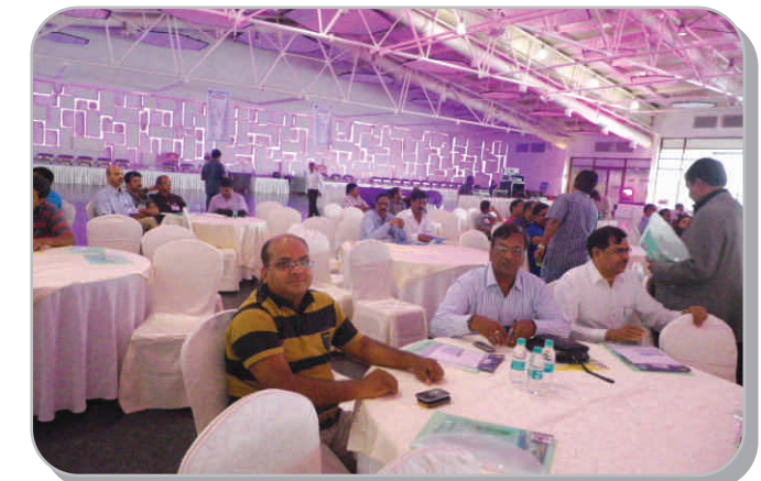
Members Enjoying at Seminar at N Convention Centre on 18th Aug 2012