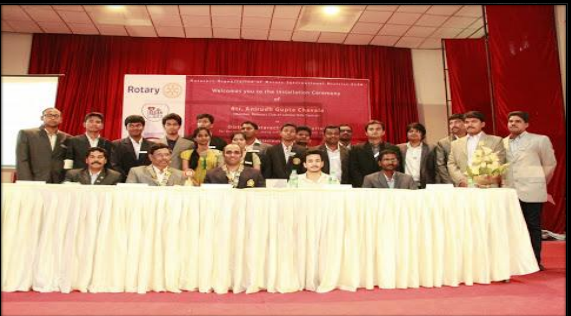
Rotaract District Council Members, RID 3150 (2014-2015)