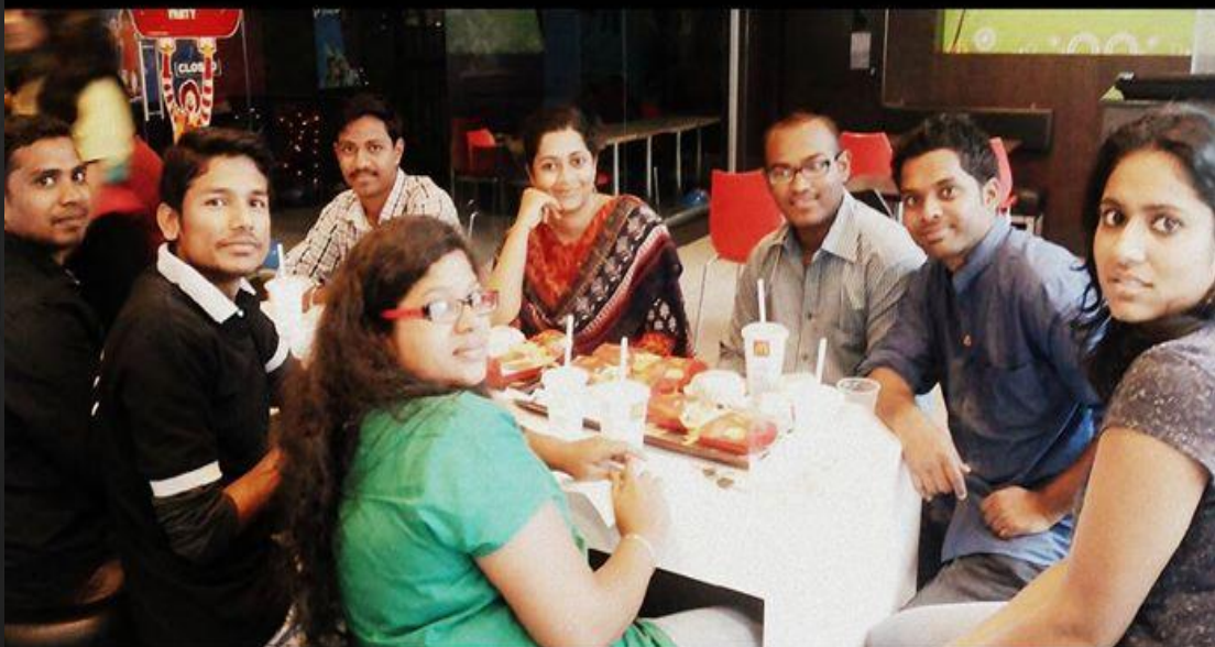
Rotaract Club of Sunrise