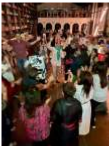
Background theme Fellowship on 28.04.2024