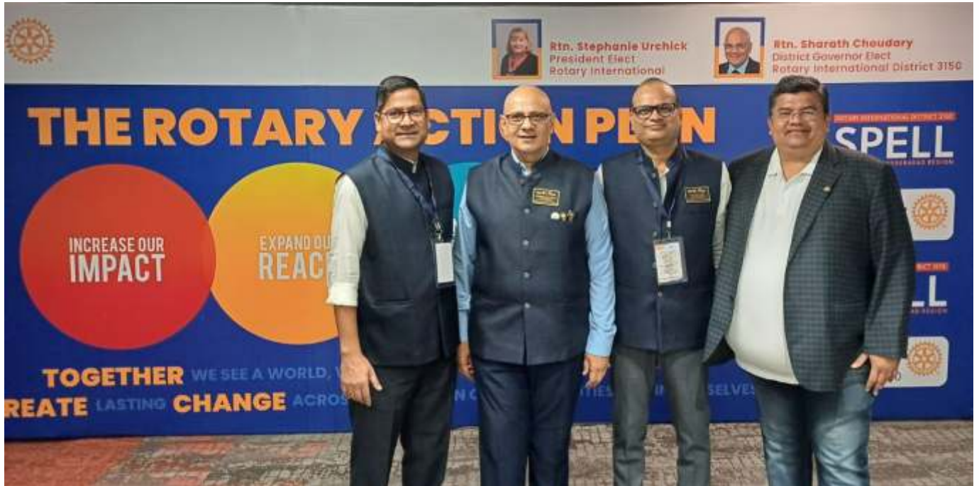
Attending SPELL (Secretary & President Elects' Learning League)..... previously called Pets & Sets.