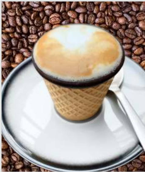
Edible chocolate coated wafer cup