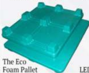
The Eco Foam Pallet