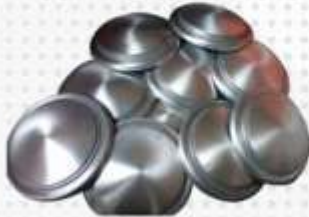
Ceiling Fan End Shield