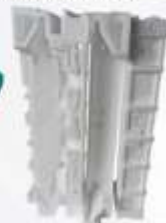
LED TV Packing Buffer