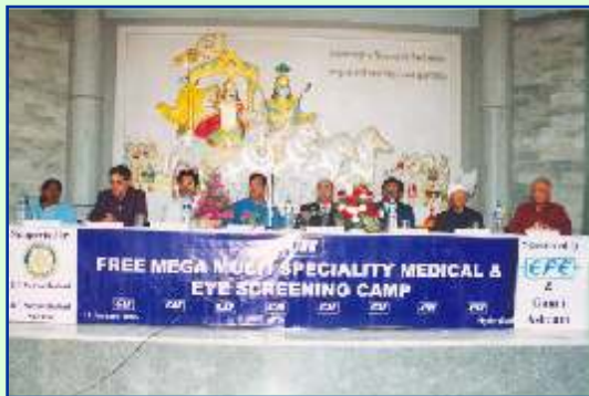
The Mega Eye and Dental Camp organized by our club jointly with RC Secunderabad and CII at Smt. Dyalibai Lalchand Gauri Ashram, Bahadurpally