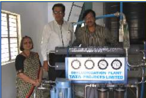
DG inspecting the Deflouridation Plant at Peddakandukur, Nalgonda District on his Official Visit to the Club