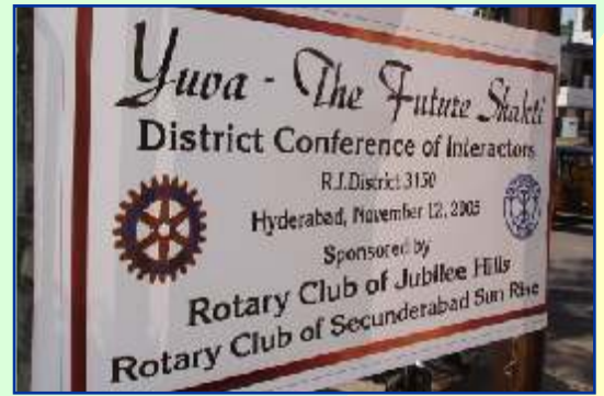
The banner at the first ever District conference of the Interactors co-hosted with RC Jubilee Hills