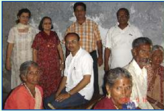
Volunteers from our club posing along with the beneficiaries at one of the many Eye Camps held.