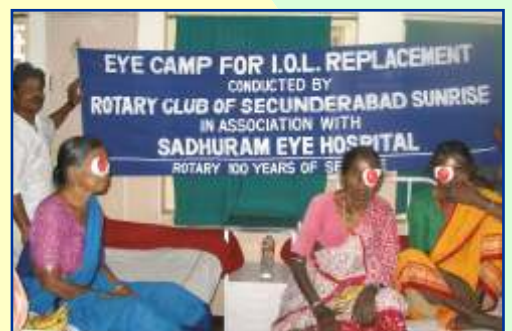
To mark the completion of 100 IOL Surgeries in association Sadhuram Eye Hospital