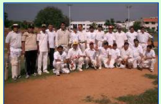
Team Sunrise along with cricketers of RC Hyderabad Deccan at the picturesque Glendale Academy Cricket grounds which we won