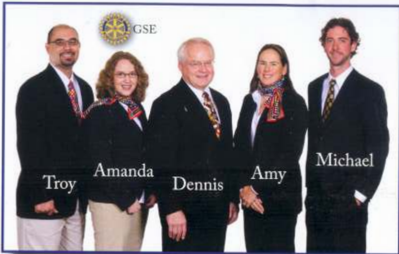
Team Brochure design by lifestorycompany.com ©2007 all rights reserved