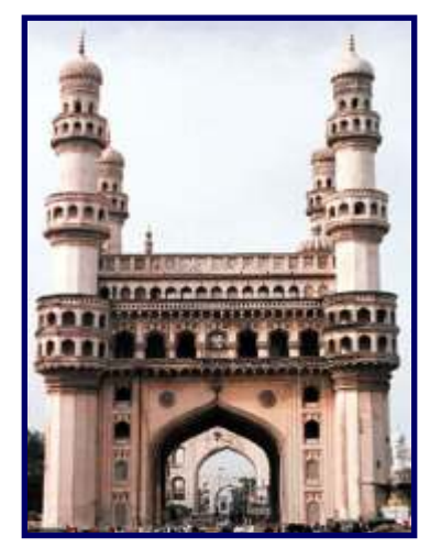
Charminar-Land mark of Hyderabad