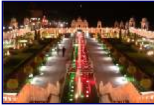
Ramoji Film City