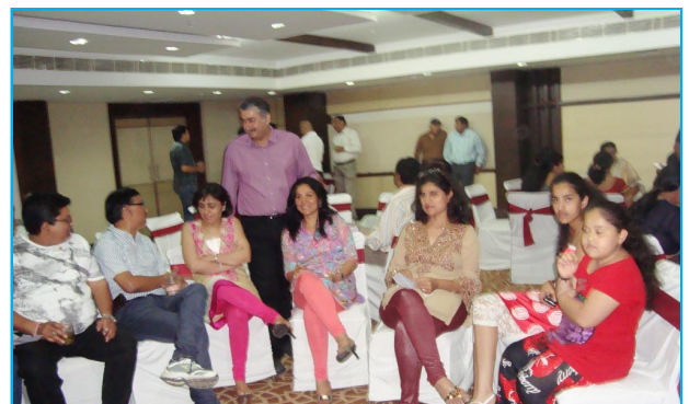
District Fellowship at Hotel Expotel