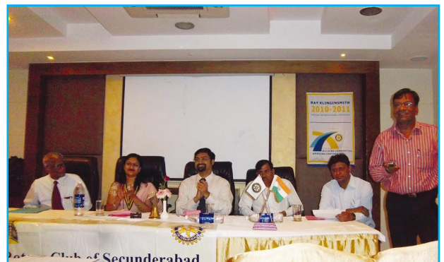
Joint Speaker Meeting at Hotel Solitaire