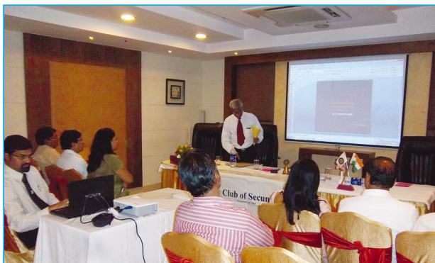
Joint Speaker Meeting at Hotel Solitaire