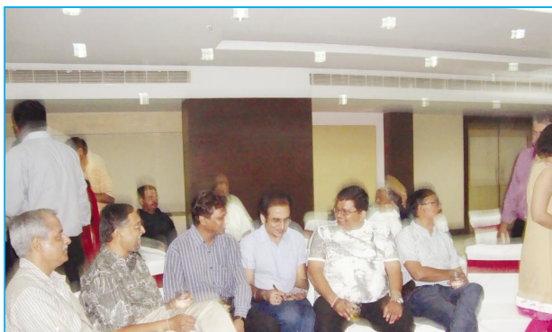
District Fellowship at Hotel Expotel