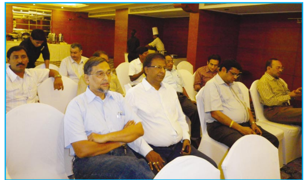
Members at Club Assembly