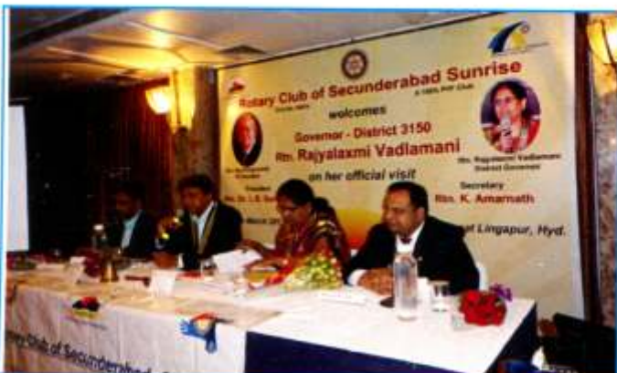
Meeting at Hotel Kamat Lingapur