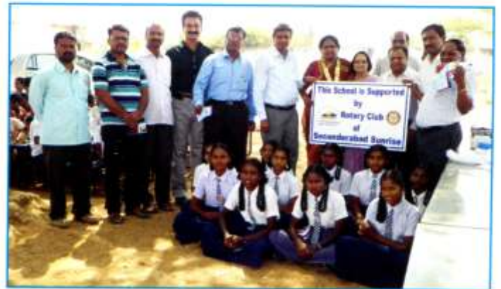
Visit to Govt. School, Molugu