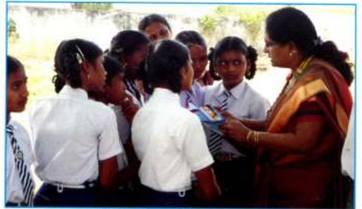
Visit to Govt. School, Molugu