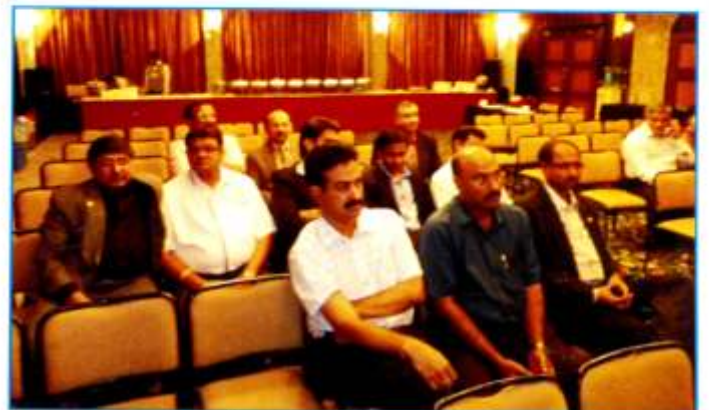
Meeting at Hotel Kamat Lingapur