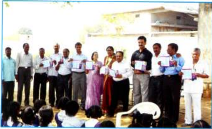
Visit to Govt. School, Molugu