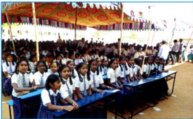
Benches Distribution Program at Molugu School