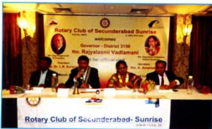
Meeting at Hotel Kamat Lingapur