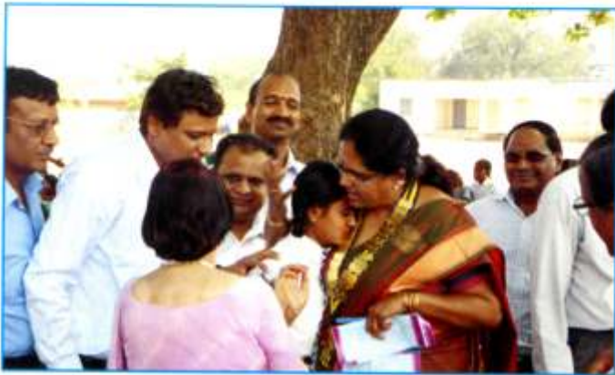
Visit to Govt. School, Molugu