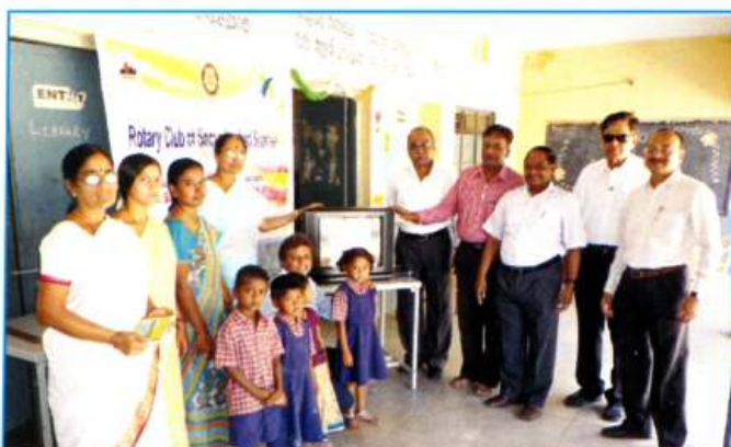
TV & DVD Player Donation to Govt. Primary School, Dovton