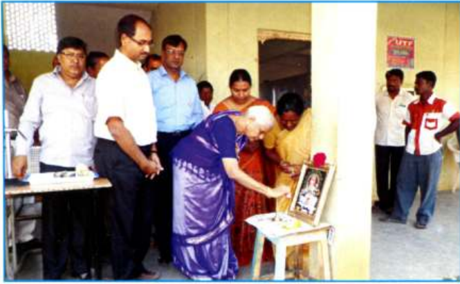
Benches Distribution Program at Molugu School