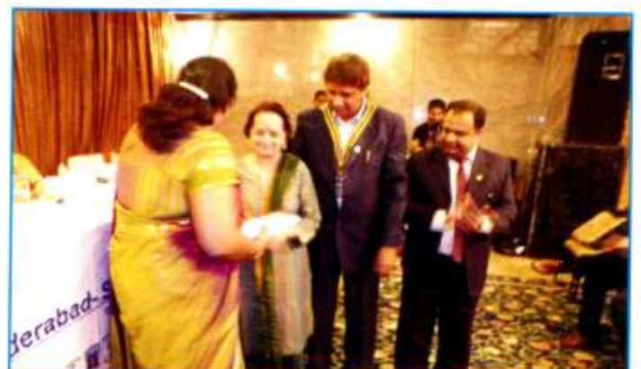
Release of Brochure at Hotel Kamat Lingapur