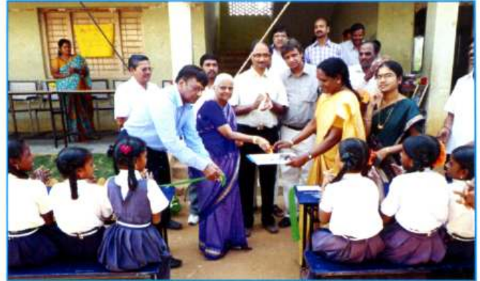
Benches Distribution Program at Molugu School