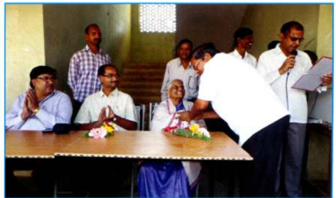
Benches Distribution Program at Molugu School