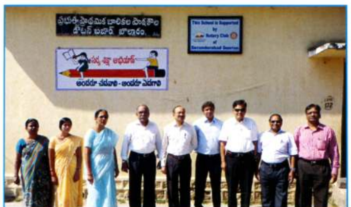
TV & DVD Player Donation to Govt. Primary School, Dovton