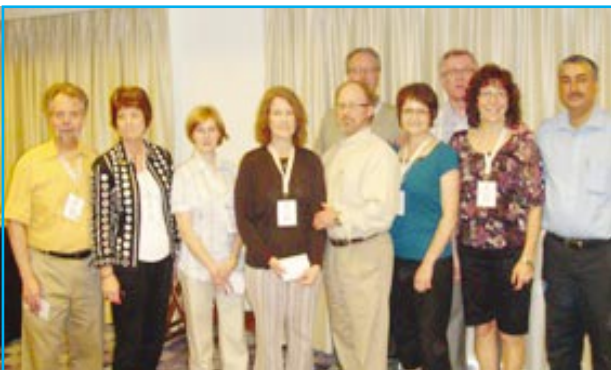
RFE Rotarians with their Anns from Canada