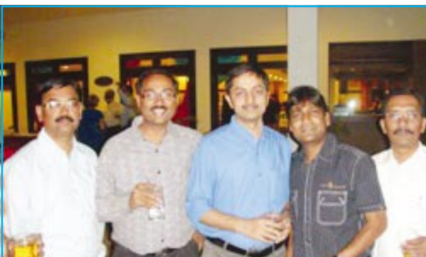
Members at the RCSS family fellowship