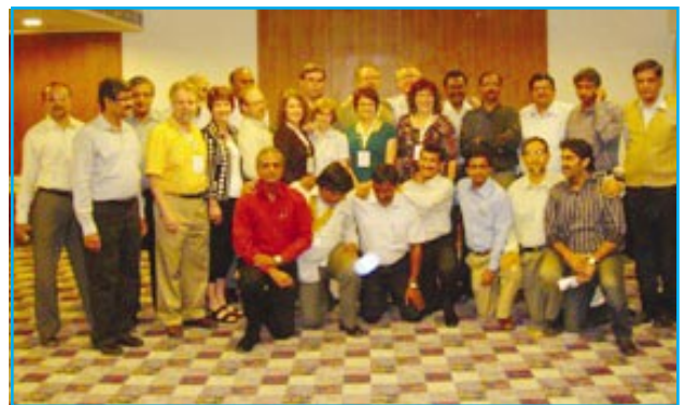
RCSS Rtn with 5 Couples form Canada RFE Team