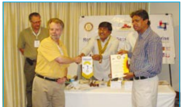
RCSS president exchanging RCSS flag with RFE Rotarian