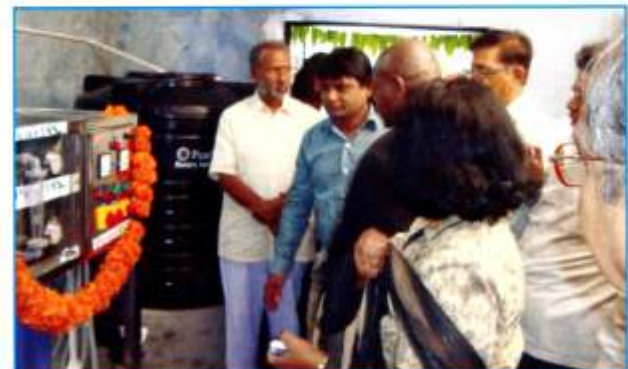
RO Project of RCSS