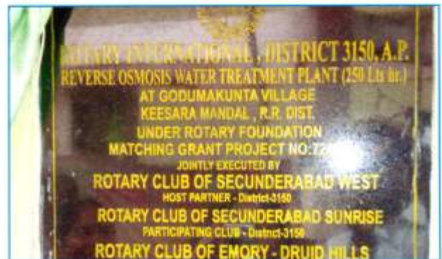
Foundation Stone at RO Plant