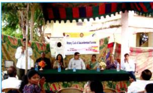
Inaguration meeting at RO Plant