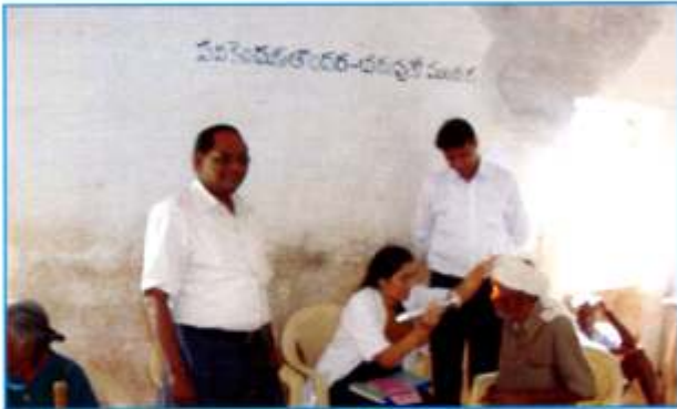
President and Past President at Medical Camp