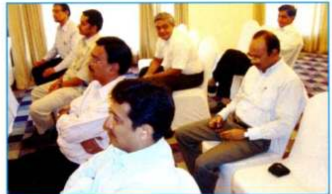
RCSS members at Speaker meeting