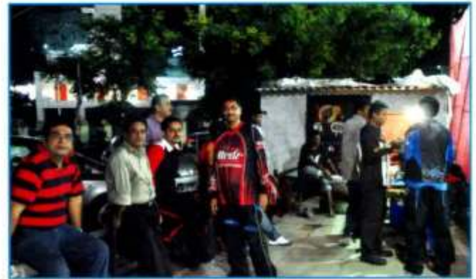
Rotarians at ladus F3 fellowship