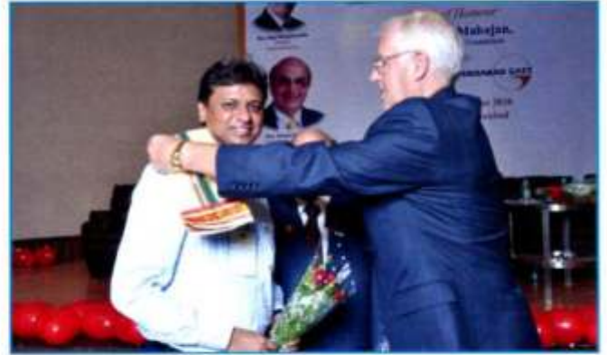
Our President being honored at foundation