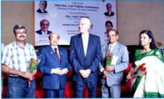
Our Founder President at Foundation