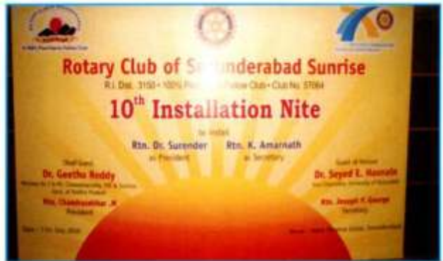
Banner of Installation Nite