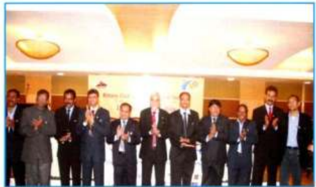
Board of Directors for the year 2010-11