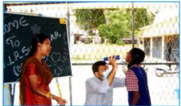
Medical camp at Government School