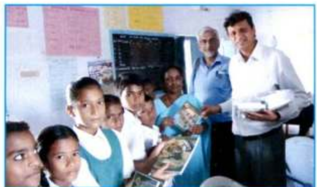
President donating books