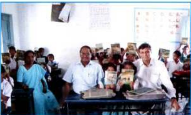
President and Director Community at Government School