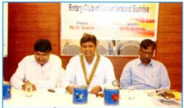
President Surender welcome address at First Club assembly