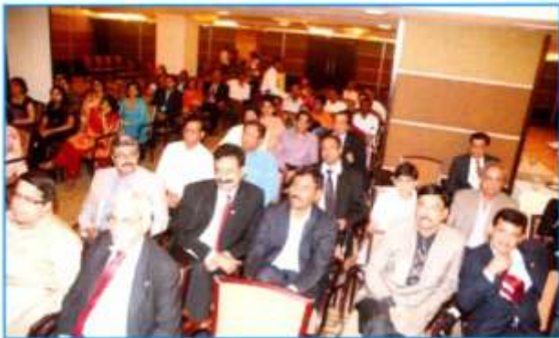
RCSS Members, Guest and their family present on Installation nite