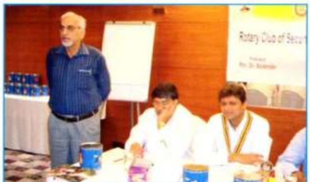
Director Membership presenting his report at Club assembly