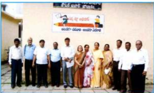
RCSS members at Service at Government School