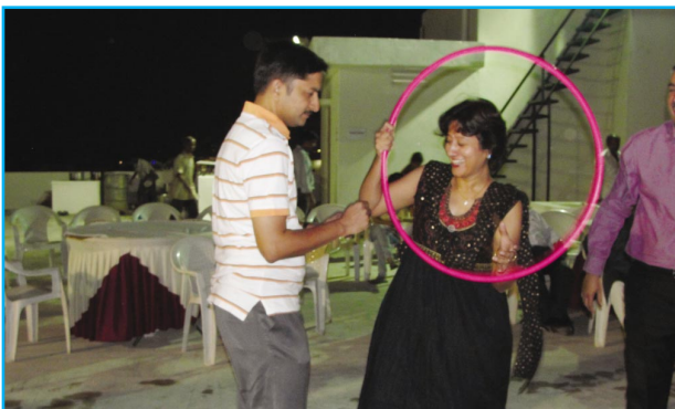
Couples enjoying at Diwali Dhamaka