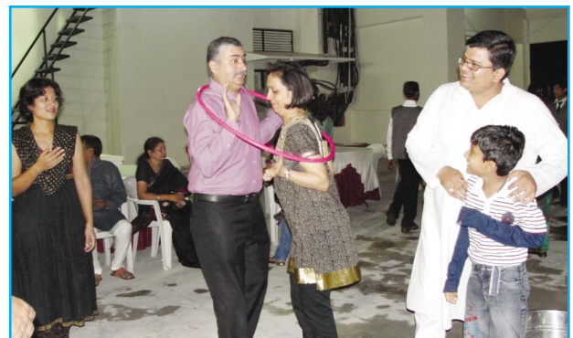
Couples enjoying at Diwali Dhamaka