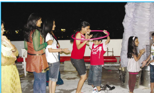
Children enjoying at Diwali Dhamaka