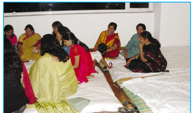
Ladies at Diwali Dhamaka