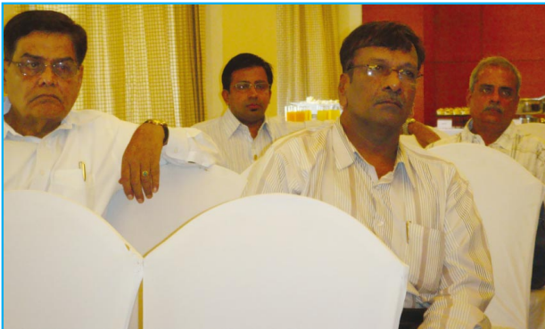
Members seen at the Speaker Meeting